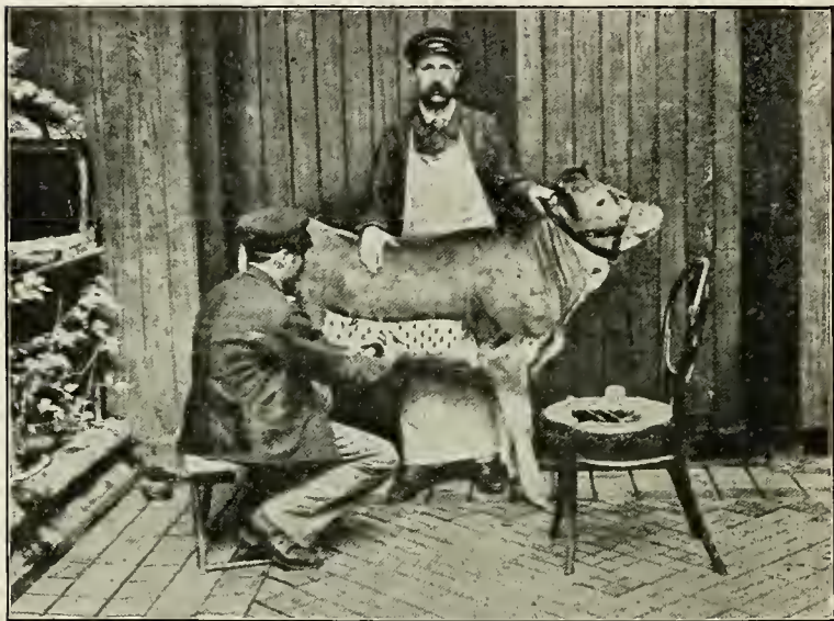
Reproduced from L. G. B. Report.

In your imagination just multiply that pain thirty to forty-fold and you will then be able to form some idea of what these